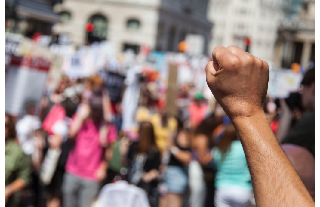
August 2019, Washington, D.C. Labor Protest