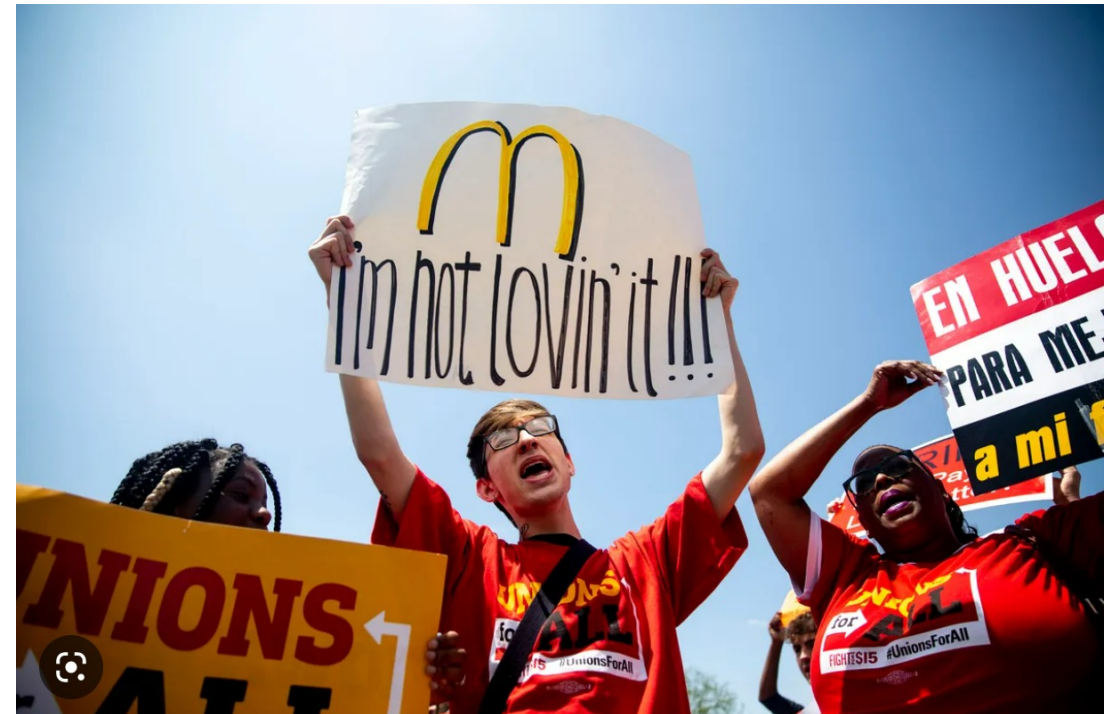
McDonald's Strike, March 23, 2019, Des Moines, Iowa