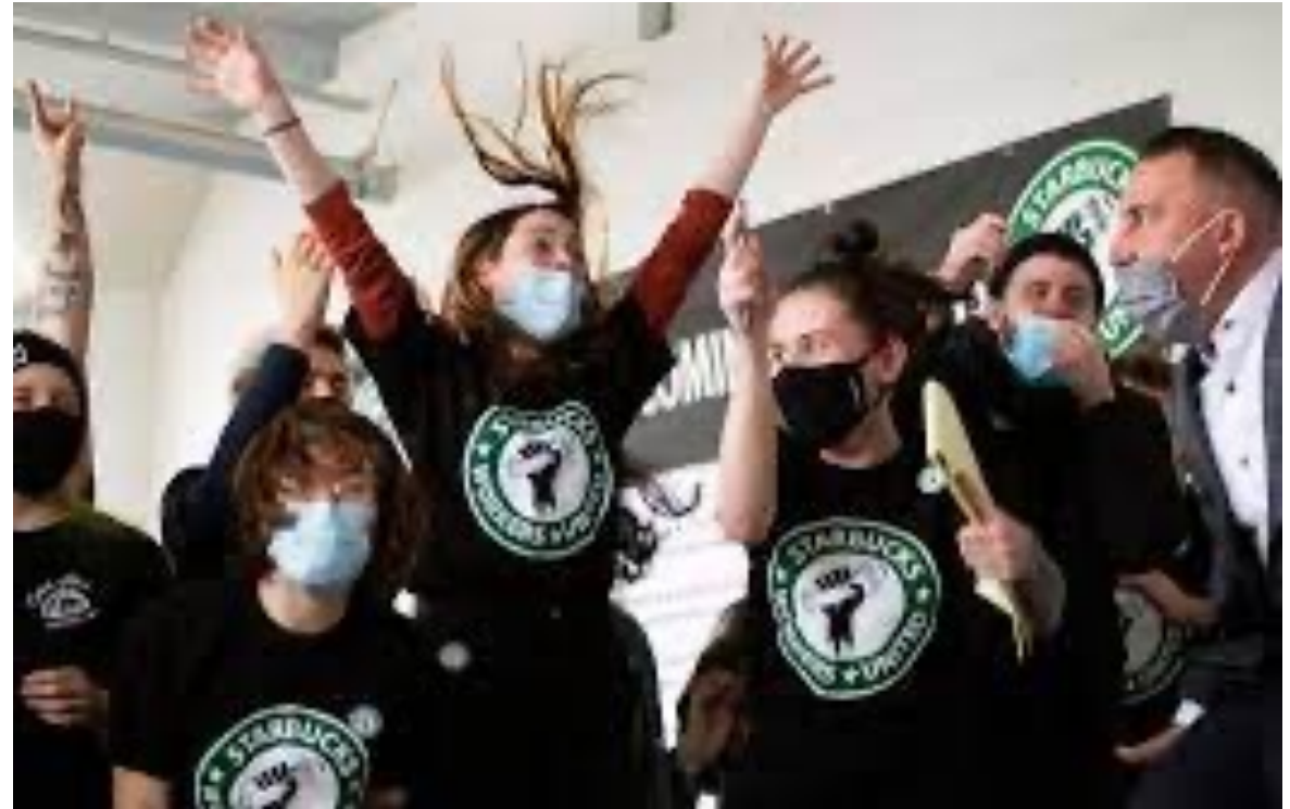
December 2021, Buffalo, New York Starbucks Union Vote