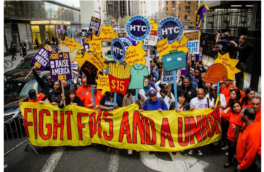
Fight for 15 Protest

By the end, more than 300 cities across the globe participated in strikes and protests